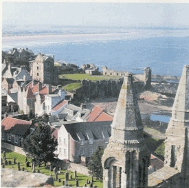
Below: The town of St Andrews stretches out below St Rules Church