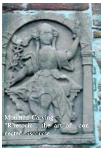
Mounted Carving "Rhetoric", the art of con- nected discourse