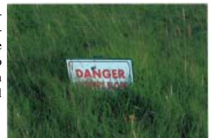
"Danger Slippery Slope". Sign found on Isle Arran, Scotland. Possible warning to debaters.