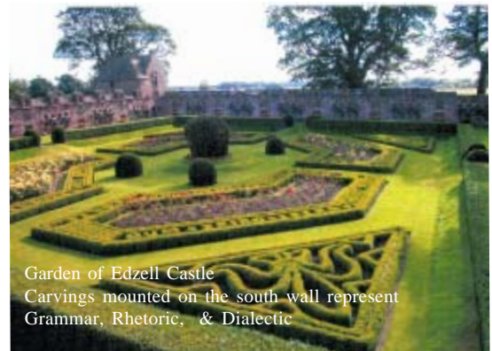
Garden of Edzell Castle Carvings mounted on the south wall represent Grammar, Rhetoric, & Dialectic

The garden was laid out in 1604 by Sir David Lindsay in his later years. He planned it to be stimulus both for the mind and the senses. To that end, Sir David ordered thought-provoking carved panels created by copying the work (1528-9) of famed Nuremberg engraver Klienmaster. The Edzell masons copied the engravings and set them into the walls of the